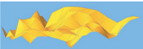
Example 3: K n function with minimal smoothing