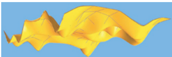
Example 2: K n method